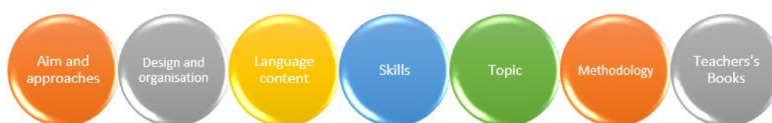
Figure 3. Textbook Evaluation Criteria according to Cunningsworth

Some experts have certain criteria for evaluating textbooks. Cunningsworth lists eight criteria for evaluating textbooks. [29] Standard suggestions include: