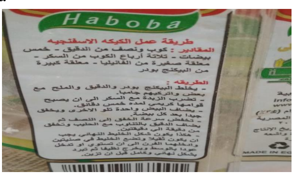
Product 2: Haboba

The four verbs have the meaning of commands, commonly referred to as imperative verbs. The imperative verb in Arabic is called (fi'il amr), which demands that someone do something to the intended person. In the four words above, it is included in fi'il amr which is often used in everyday life.