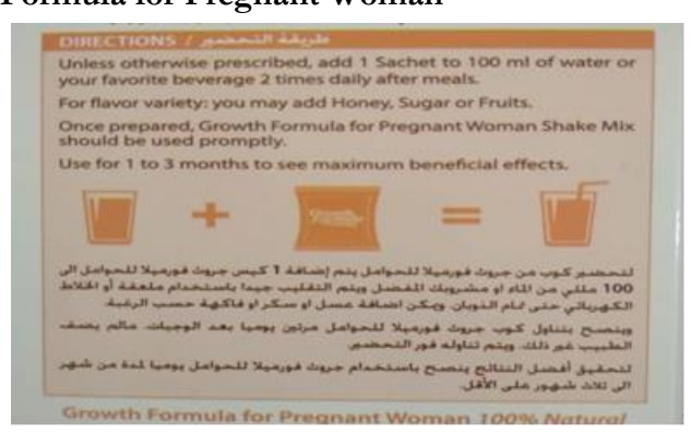
Product 3: Growth Formula for Pregnant Woman

The four words are referred to in (fi'il amr) or the word command. It is not too much different from the command word in the first product. It's just that there are differences in the use of the word "enter" contained in the packaging of the first product and the packaging of the second product. The first product uses the word (إفراغ) for the meaning of input, while the second product uses the word (یضاف) for the meaning of entering.