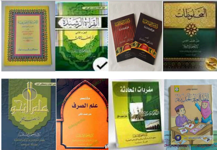
Picture 1. Books used in the NAFIRA Program

With this division, learning in the NAFIRA Program becomes more structured, gradual, and directed. Ula class students are prepared to master the basics of Arabic language strongly, while Wustha class students are directed to deepen and expand their abilities so that they are able to read, understand, and communicate in Arabic more fluently and critically.