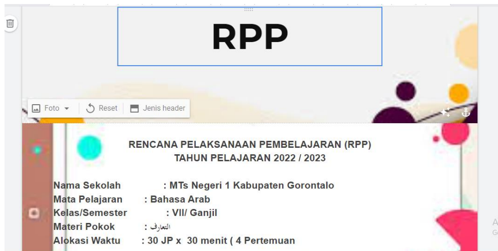
Picture 3: lesson plan display on Maharatul Qiraah Website media MT's N 1 Gorontalo Regency

Website media also contains lesson plans, which are used to facilitate the teacher in the learning process.