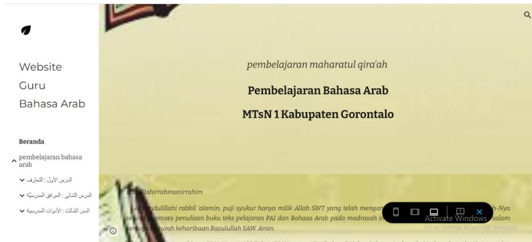
Picture 2: Table of contents display on the media Website Maharatul Qiraah MT's N 1 Gorontalo Regency

The table of contents on the Arabic Language Teacher website media is used to make it easier for students to move and find the next page.