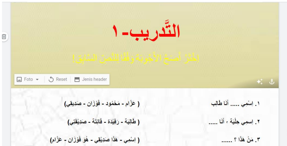
Picture 5: Table of contents display on the media Website Maharatul Qiraah MT's N 1 Gorontalo Regency

On the practice questions page, researchers included practice questions from the KMA 183 book.