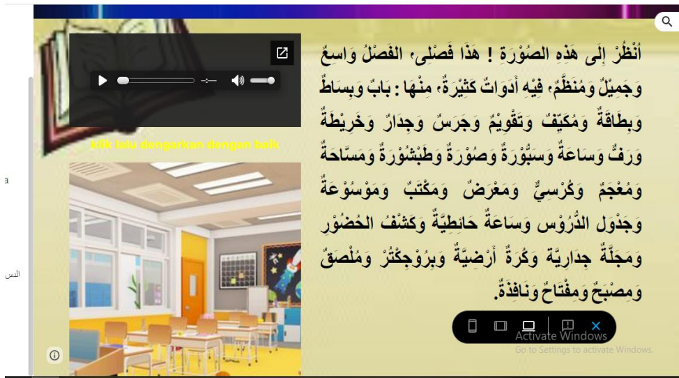
Picture 4: material page display on the media Website Maharatul Qiraah MT's N 1 Gorontalo Regency